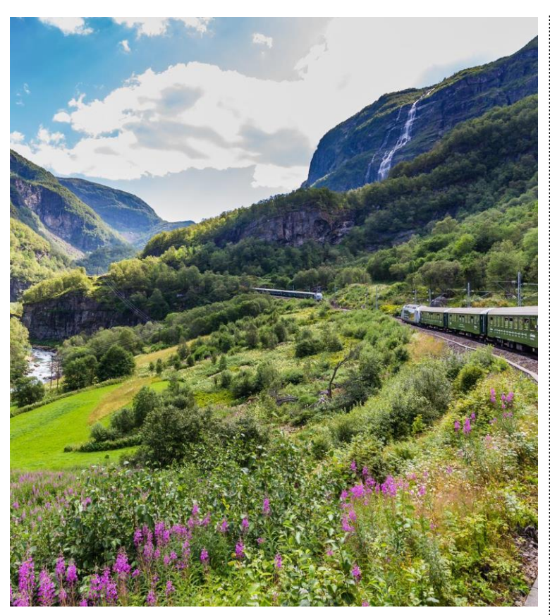
15 Days • 22 Meals: 13 Breakfasts, 2 Lunches, 7 Dinners

HIGHLIGHTS... Stockholm, Choice on Tour: Vasa Museum or ABBA Museum, Sofiero Palace, Copenhagen, Tivoli Gardens, Choice on Tour: National Museum of Denmark or Explore Nyhavn, Oslo, Borgund Stave Church, Flam Railway, Geirangerfjord Cruise, Bergen